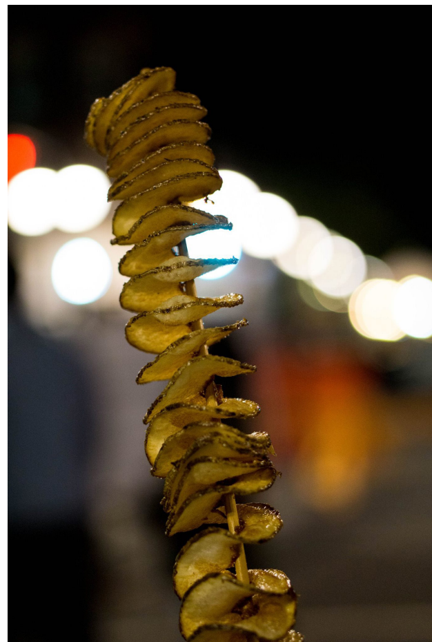
a potato tornado in all of its glory

Supercrawl 2017 was the perfect weekend to pretend to sing along to music I didn’t know, steal ideas from local